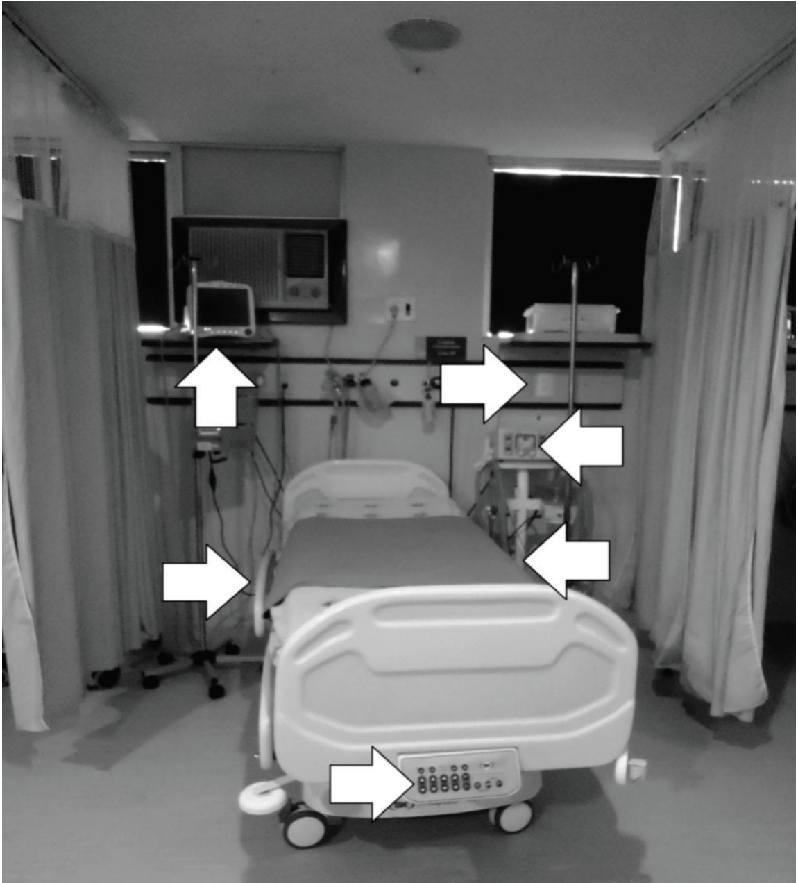
Figure 1. Equipment collected (arrows) in each bed

The collected data were typed, validated and processed in the software Excel 2010 (Microsoft Office). Descriptive analysis was applied to obtain the percentage of samples.